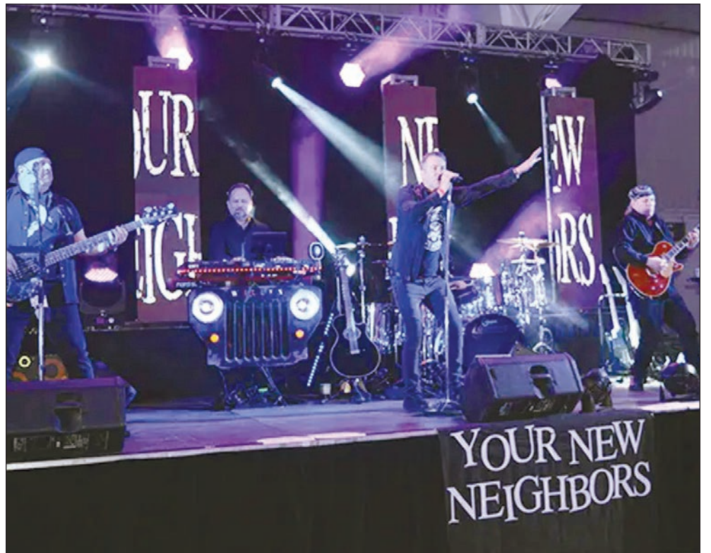
ROCKIN' TOTENHAM — Your New Neighbors will be back at the Tottenham Community and Fitness Centre on May 2 to rock the annual C.R.I.C. Draw & Dance. The band plays covers of popular music through the decades. Fund raised through the event support local charities and community-based initiatives.

C.R.I.C. is also calling on community members to get involved behind the scenes. Volunteers are needed to help make the event a success, particularly those with up-to-date Smart Serve certification for bar