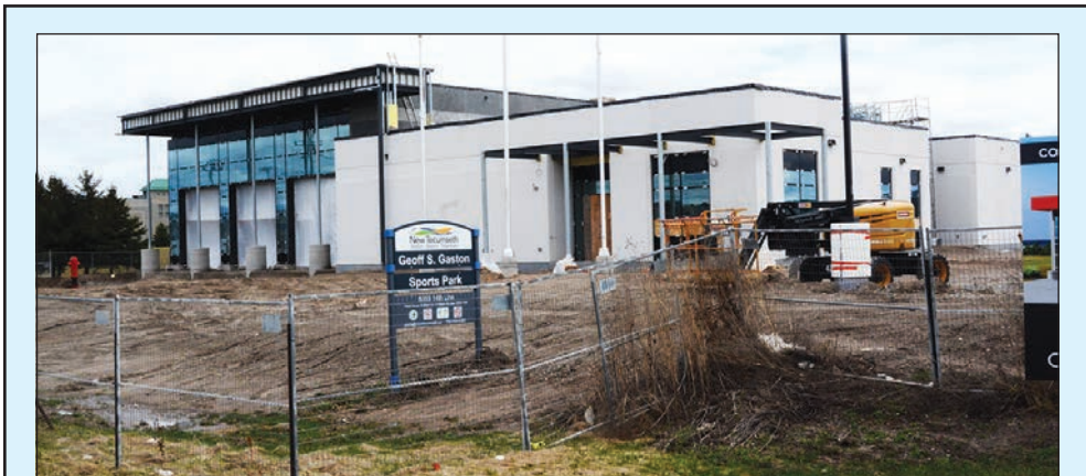
PROGRESS CONTINUES – Construction on New Tecumseth Fire Station #4 is progressing and is on budget and on schedule. The new fire station, located on the 14th Line near the Briar Hill subdivision, will meet the need for expanded fire and rescue services as the town grows. The facility is expected to open in the fall of 2026 with the completion of the building and the arrival of the new fire trucks and apparatus.