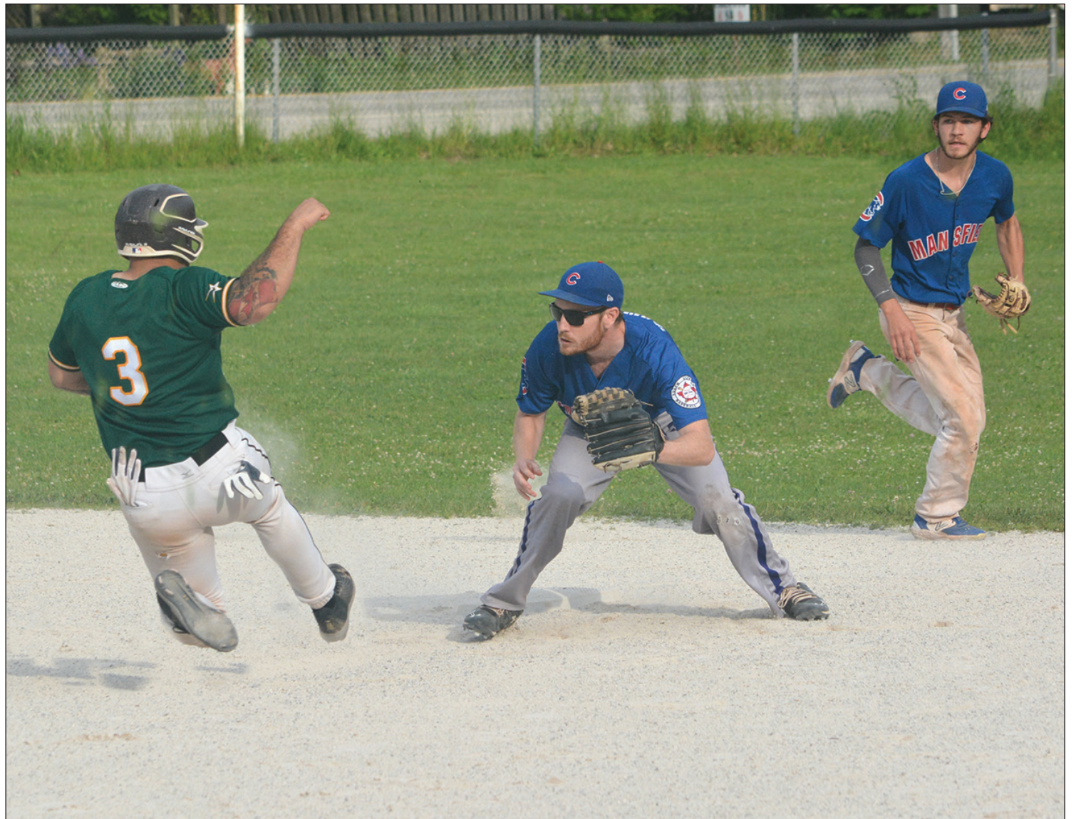
SEASON STARTER – The North Dufferin Baseball League is getting ready for the 2026 season. The Senior Division has a full lineup of 12 teams. The Junior Division has seven teams, including two new entries for this year.

Beginning in 1930, the League will soon be celebrating its 100th season.