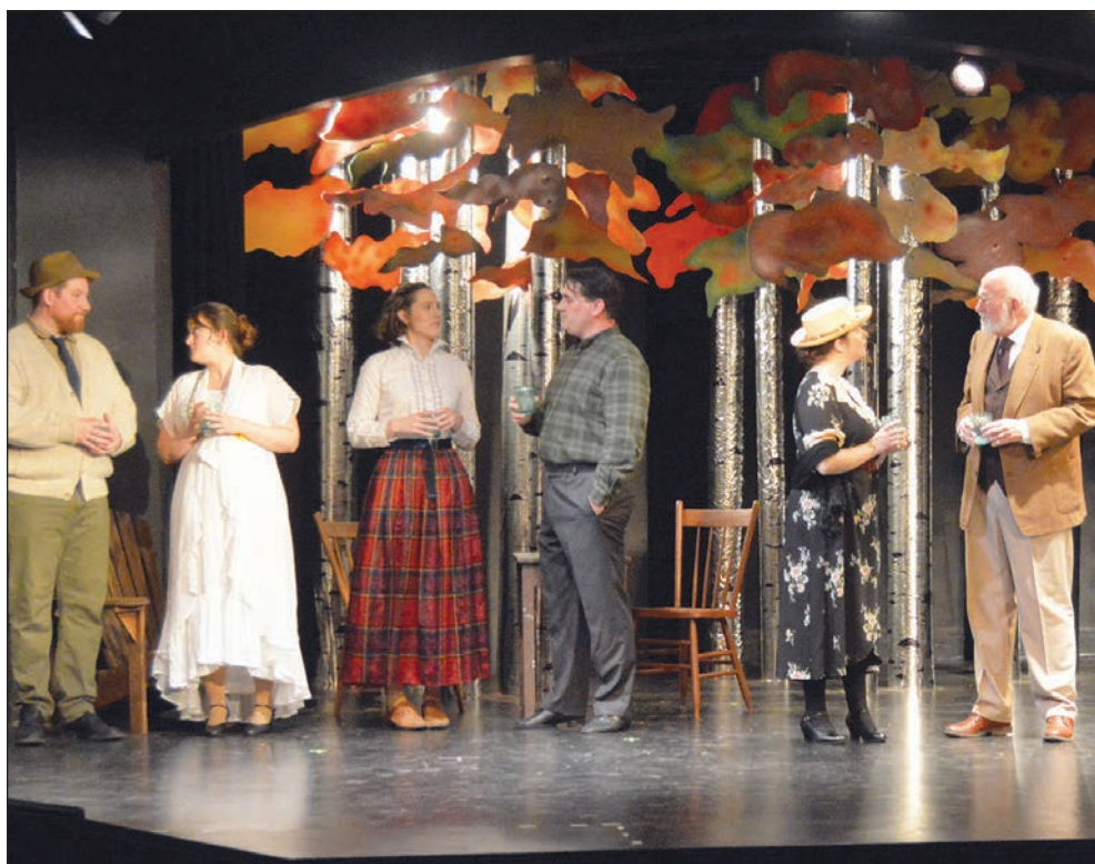
PAINTED LEGACY – The South Simcoe Theatre explores the life of legendary Canadian painter Tom Thomson in its production of Colours in the Storm , now on stage at its Cookstown location. This musical is set between 1915 and 1917, when Thomson explored and painted Algonquin Park in Northern Ontario.