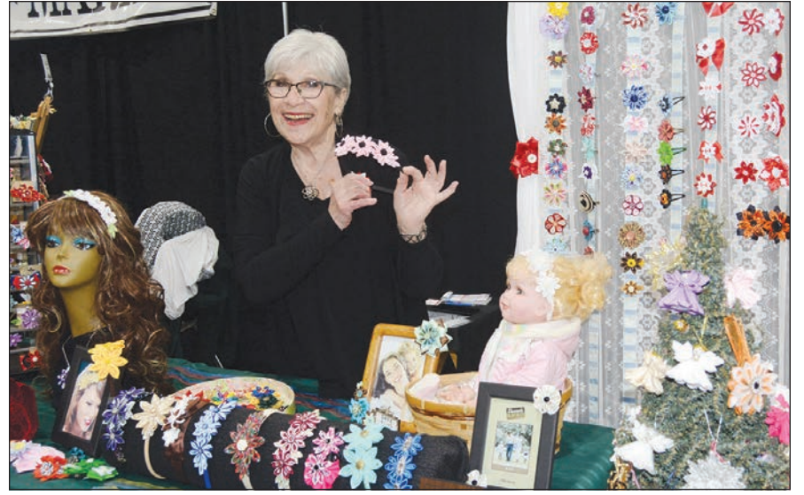
COMMUNITY SHOWCASE – The Tottenham Home Show & Artisan Market, sponsored by the Tottenham & Beeton District Chamber of Commerce, took over the Tottenham Community Centre on Saturday, April 25. The event featured vendors, businesses, and organizations showcasing their services and products. The event was well attended, with quite a few new businesses this year.