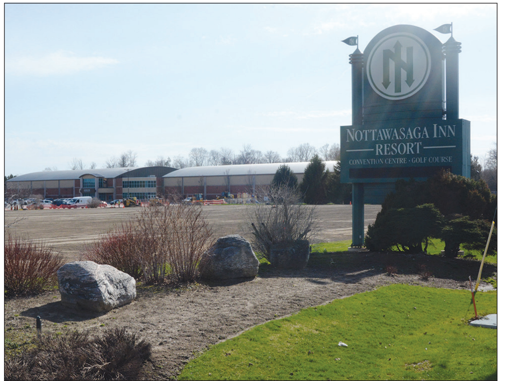
TEAM HOST – The Nottawasaga Resort is currently preparing its main soccer pitch for the 2026 FIFA World Cup. The resort will be hosting Team Panama during the competition.

The presence of Team Panama is expected to generate increased interest in the area, encouraging visitors to explore New Tecumseth’s local restaurants, accommodations, recreation opportunities, and small businesses, while strengthening the Town’s reputation as