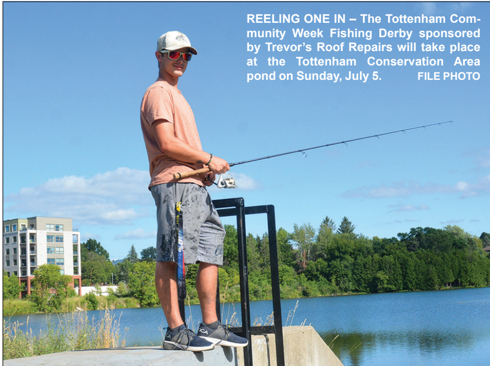
REELING ONE IN – The Tottenham Community Week Fishing Derby sponsored by Trevor's Roof Repairs will take place at the Tottenham Conservation Area pond on Sunday, July 5. FILE PHOTO

Polish your lures and collect your worms; the derby will provide a morning of friendly fishing competition.