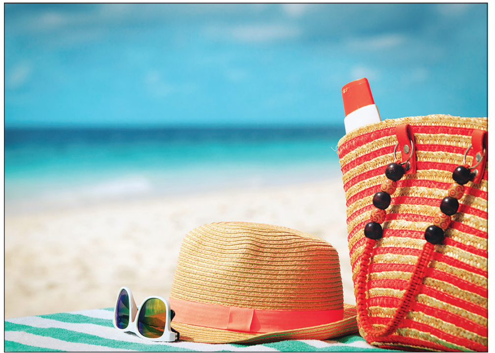
WATER CHECK – With the warmer weather now here, many people will be visiting local beaches. It is advised to check water quality reports before heading to your favourite beach.

Warm, shallow water and wet sand can create conditions that allow bacteria such as E. Coli to multiply more easily.