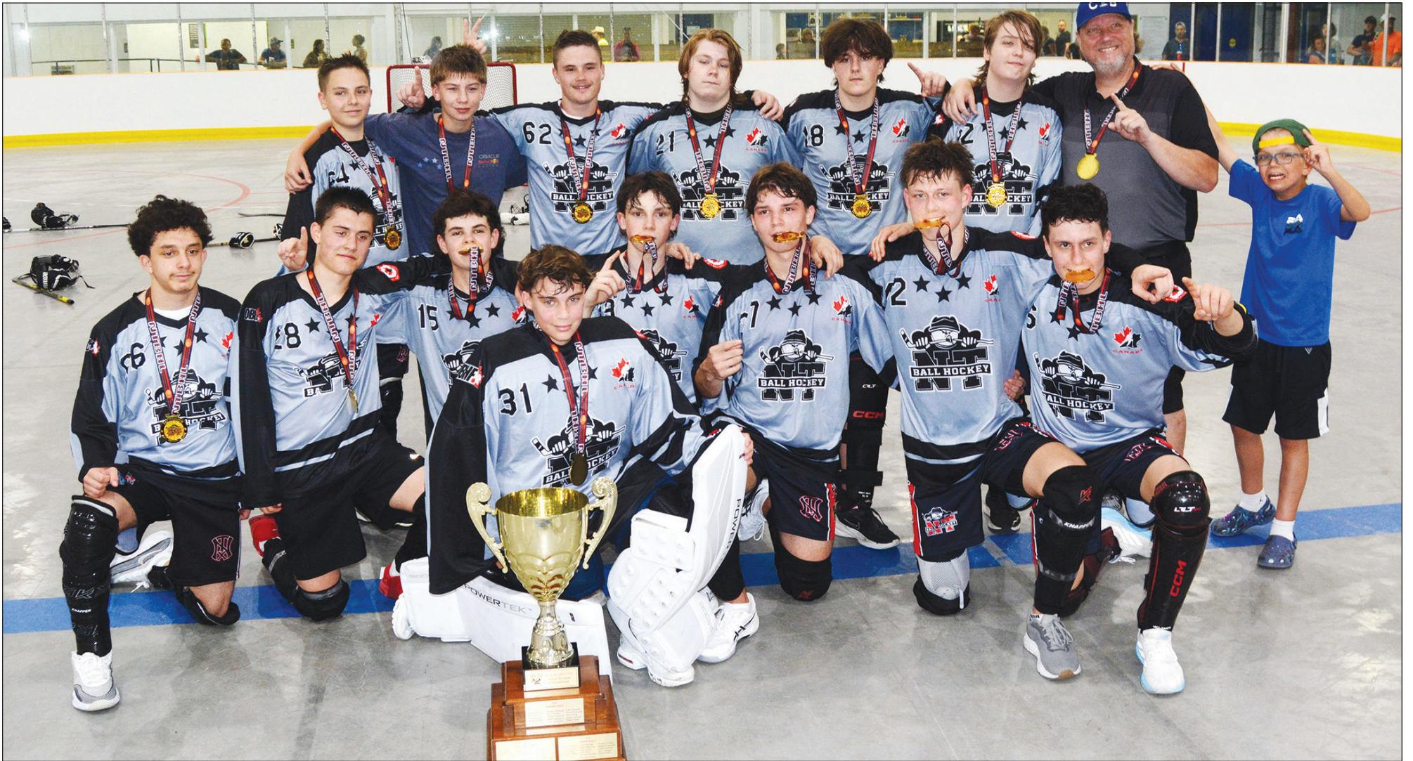
TOP OF THE PACK – The New Tecumseth Ball Hockey League held champion house league final games on Tuesday, June 23. The New Tec Grey Team is the 2026 champions after winning over the Blue Team in the final game on the floor at the Tottenham Community & Fitness Centre in the U16 final.