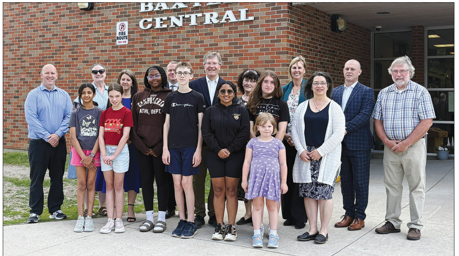
EXPANSION FOR EDUCATION – Baxter Central Public School will receive a $5 million addition as part of the province’s plan to invest $1.6 billion in 79 school construction projects across Ontario.

“We appreciate this investment by the Ministry of Education in support of an addi-