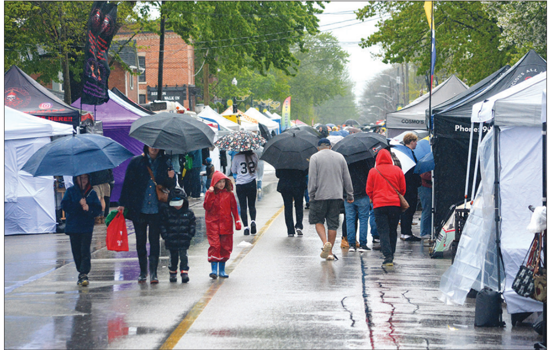
BEETON BRAVES THE RAIN – The annual Beeton Honey Festival took place on Saturday, May 23, in downtown Beeton. Unfortunately, the weather didn't cooperate this year, and there was steady rain all day. Some people braved the elements under raincoats and umbrellas, but the large crowds of previous years didn't happen at this year's event.

We are looking forward to all these events and festivals. We hope to see you!