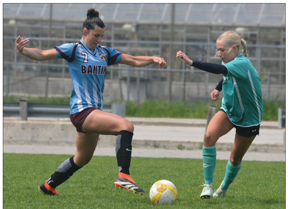
SENIOR SUCCESS – The Banting Memorial High School Marauders girls' senior soccer team host Nantyr Shores Secondary School on the soccer pitch at Banting on Wednesday, May 10, for the Simcoe County Athletic Association (SCAA) final. Banting won the game 1-0.