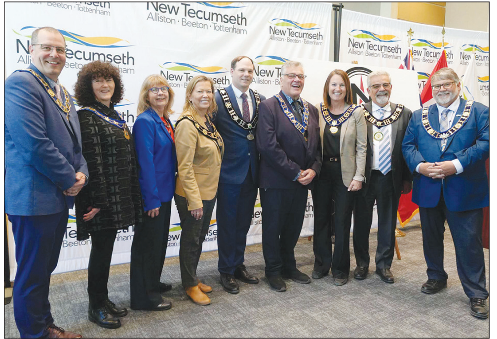
STRONG MEET – The Simcoe County Auto Mayors held a special meeting at New Tecumseth council chambers on Thursday, May 21, to sign the Canada North Strong initiative. The mayors are calling on the federal government to change policies and support local automotive manufacturing.