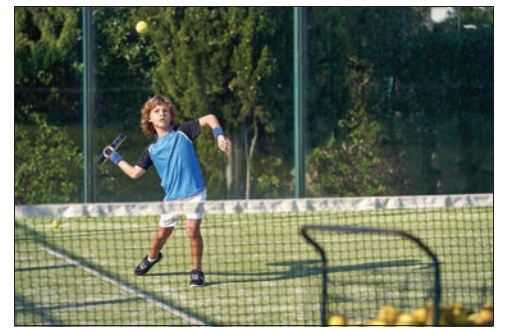
LEARNING THE GAME – The Alliston Tennis Club will host introductory sessions for kids who want to learn to play tennis or are new to the sport.