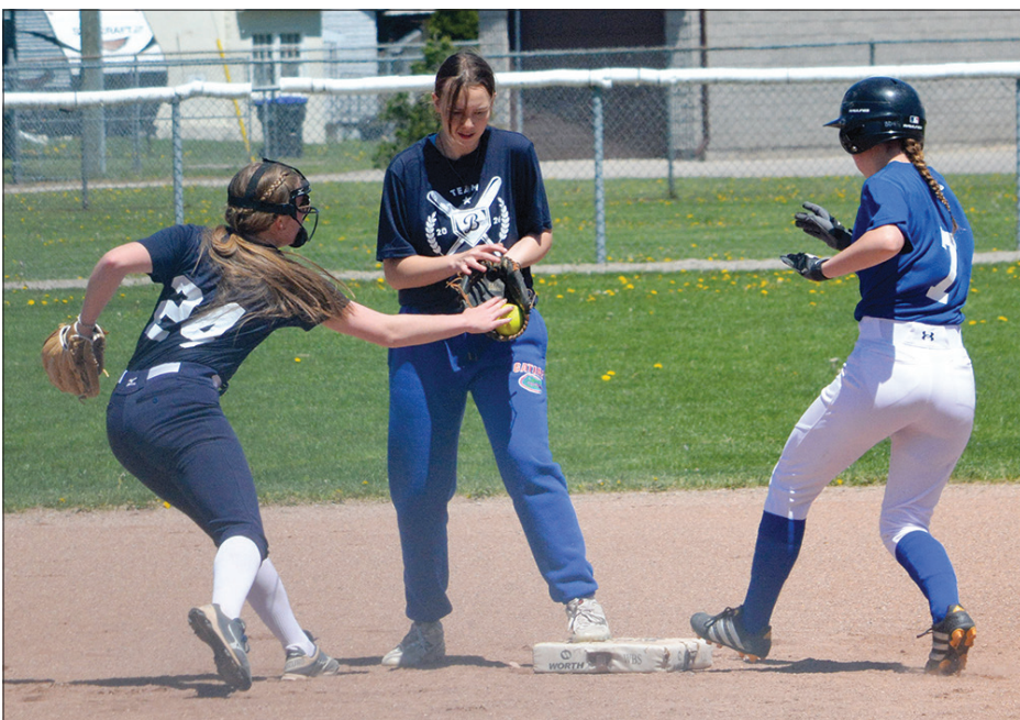
SQUEEZED OUT – The Banting Memorial High School Marauders varsity girls' slo-pitch team compete against the Bradford District High School Bucks at PPG Park in Alliston on Thursday, May 21. The Marauders played a good game but were squeezed out by a single point, losing 7-6. A play at second base puts a Bradford base runner out by a split second.