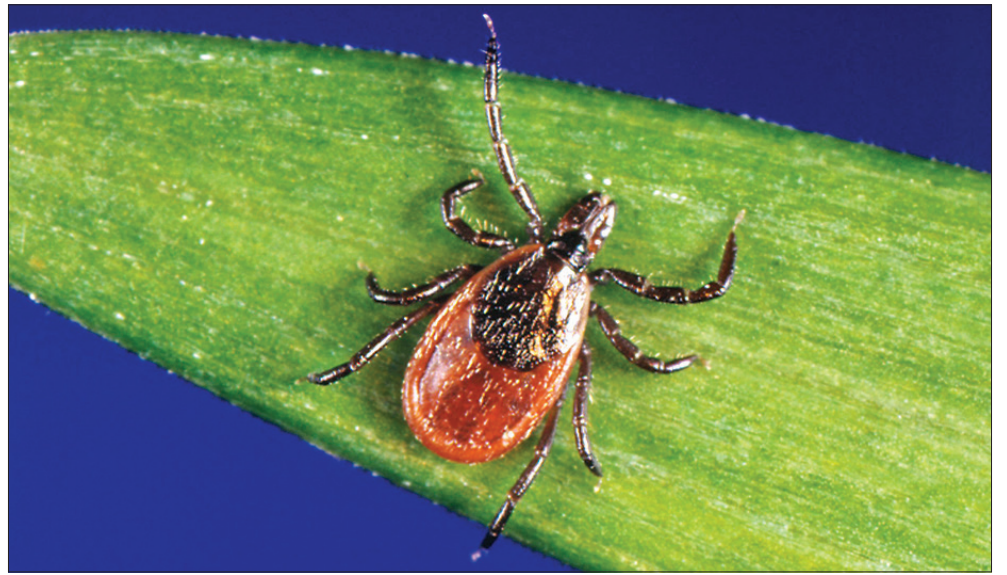
RISING RISK – The risk of running into a tick is increased this year, with reports showing 40 per cent more Lyme disease-carrying ticks present in Ontario this year. STOCK PHOTO

If you experience symptoms, seek immediate medical attention.