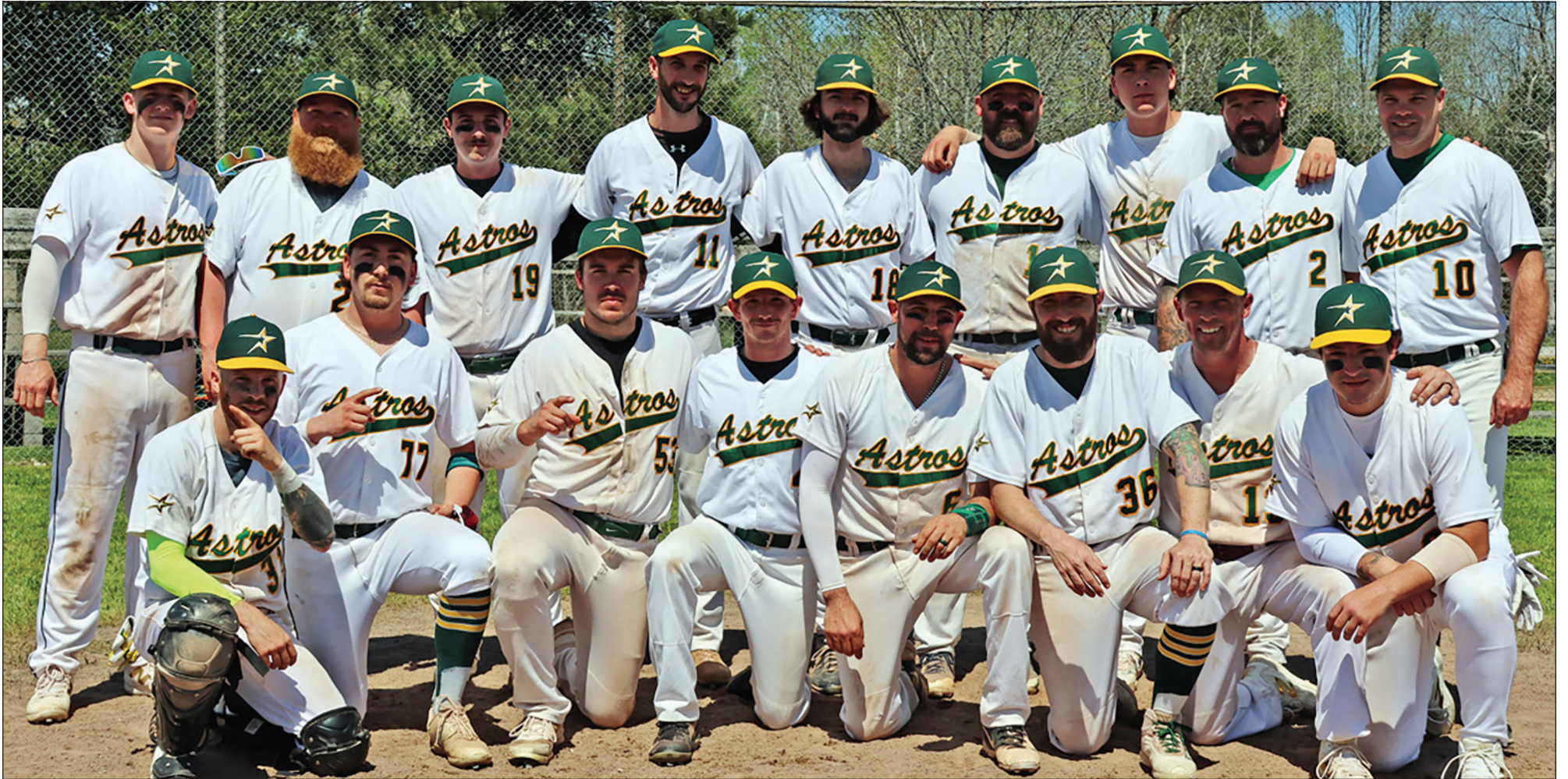
TOP TEAM – The Lisle Astros from the North Dufferin Baseball League won their own Victoria Day weekend senior baseball tournament, held on the diamond in Lisle on May 17 and 18. The Astros left the diamond with a 17-7 win over the Orillia Majors in the final game.

The Lisle team last won its tournament in 2024. No tournament was held in 2025.