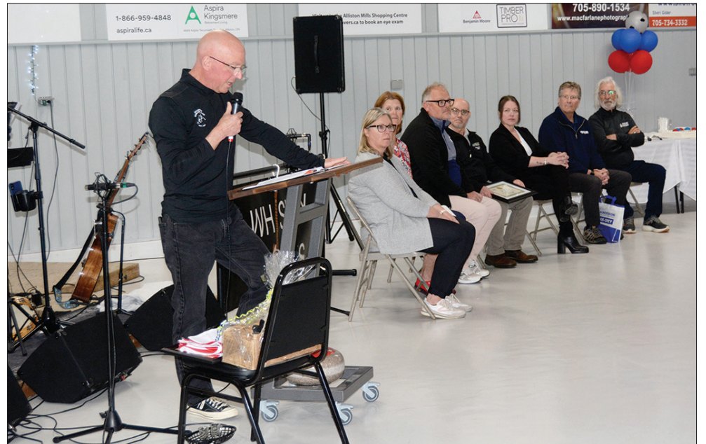
MILESTONE EVENT – The Alliston Curling Club is currently celebrating 125 years as a local organization. The club held a special day on Saturday, May 23, to celebrate this milestone in the club’s history.

The Alliston Curling Club is always looking for new members and offers introductory sessions to help new players learn the sport.