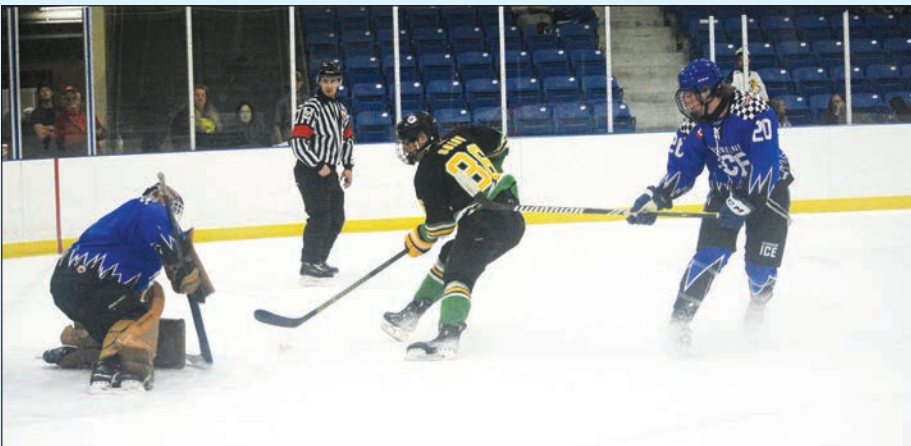
STINGING LOSS – The Alliston Hornets take on the Georgina Ice during the Hornets' annual Junior C tournament at the New Tecumseth Recreation Centre, which took place from Sept. 4 to 7. The Hornets took a 4-3 loss in that game. The Alliston team was eliminated after a 3-2 loss to the Hanover Barons on Saturday, Sept. 6. In the final game of the tournament, the Uxbridge Bruins came out on top with a 3-0 win over the Penetang Kings to win the tournament.