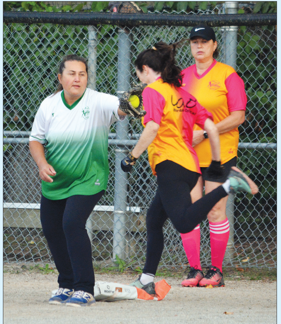
TIE GOES TO THE RUNNER – A player is safe at home after touching the plate the moment the ball lands in the glove during a Tottenham Women's Slo Pitch game between Tottenham Chiropractic and Affordable Optical on the diamond at Keogh Park in Tottenham on Tuesday, Sept. 2. Slo pitch is now in playoff mode around the region.

If necessary, Game Five will take place in New Lowell on Saturday, Sept. 20, at 1 p.m.